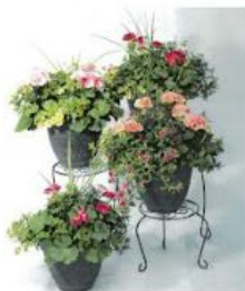
12" Geranium Combo $35.00 Available in: Red, Pink, and Salmon