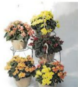
Rieger Begonia $25.00 Available in: Pink, Red, and Tri Color