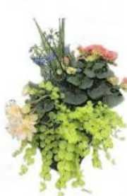
12" Begonia Shade Combo $30.00 Available in Assorted Only