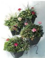
14.5" Geranium Combo $40.00 Available in: Red, Pink, and Salmon