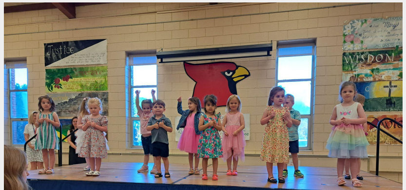
Pictures of our Preschool and Young 5's students at their graduation program! Congratulations!

The move has begun for our Young 5's room! We're very excited to move our Young 5's class to a bigger room with 2 bathrooms in the room as well as air conditioning. Follow our Facebook to see the reveal when the room is all done!