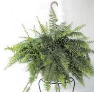
Boston Fern $25.00