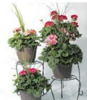
10" Geranium $25.00 Available in: Red and Pink