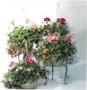
Geranium Combo $25.00 Available in: Red, Pink, and Salmon