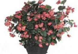
14" Whopper Begonia $36.00 Available in Assorted Only