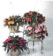
New Guinea Impatiens $25.00 Available in: Red, Pink, and Purple,