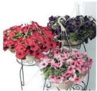
Wave Petunia $25.00 Available in Assorted Only