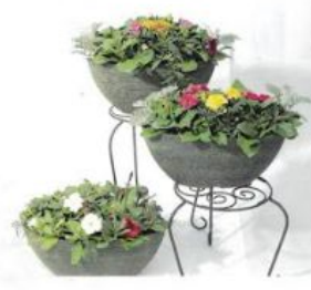
15" Oval Annual Combo $15.00 Available in Assorted Only