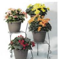
10" Rieger Begonia $25.00 Available in: Pink, Red, and Orange