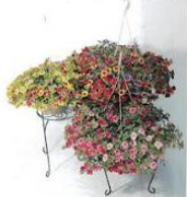
Million Bells $25.00 Available in Assorted Only